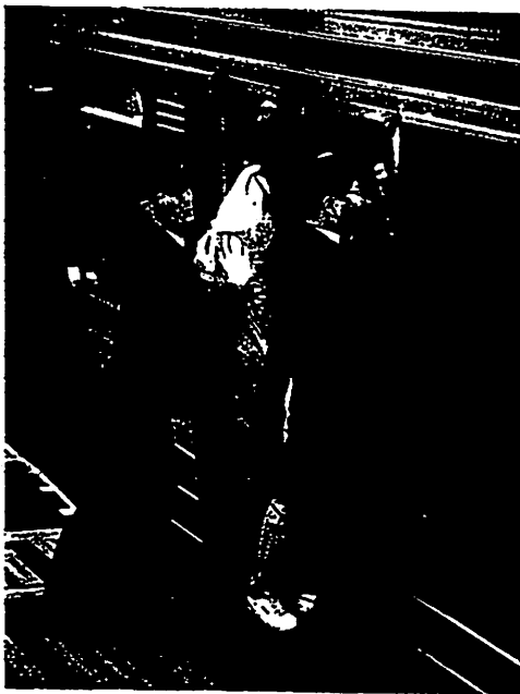
Push: For most Japanese businesspeople, the long working day begins on the trains.

The ordinary warrior ( samurai ) in the Edo Period had it even easier. The country was closed off to the rest of the world so there were no security threats from overseas, nor were there any domestic wars to be fought. Work consisted of