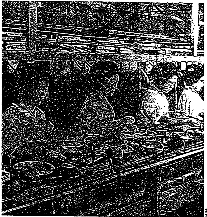
A 1903 report by the then Ministry of Agriculture and Commerce describes the forced 15-18 hour work shifts of women in the spinning factories. The report portrays the men as work shy.

Not only do Japanese have longer normal working hours than people in most other countries, they put in more overtime too. Statistics prepared by the Ministry of Labor show the average worker logging 1,920 hours on the job in 1993, which is roughly on par with Americans or Britons, but, as the ILO takes pains to point out, that does not include "service overtime," for which no wages are paid. The statistics prepared by the Ministry of Labor only count paid overtime, but the Management and Coordination Agency has done its own surveys, talking to working families directly. It finds that real working hours a year are about 350 more than the Ministry of Labor statistics suggest. One can assume that the discrepancy represents average unpaid "service overtime." There are also major differences in the hours worked depending on one's